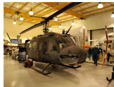
Bell UH-1 "Huey"