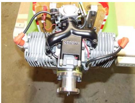
Zenoah GT-80 on a 1/3 scale Super Cub Bob Beardsley