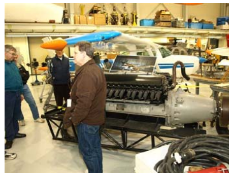
Allison engine out of a P40