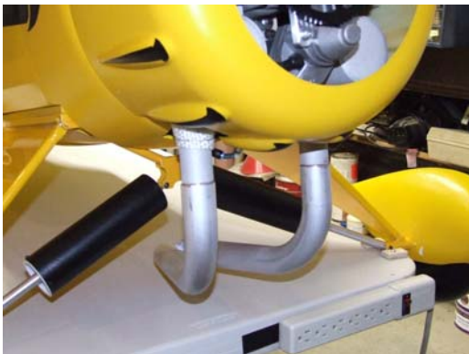
WACO Exhaust Headers