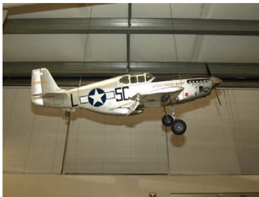
A model one of the students built