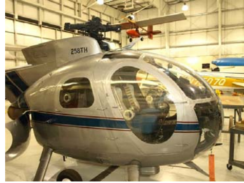
Huges helicopter the students learn maintenance tasks on