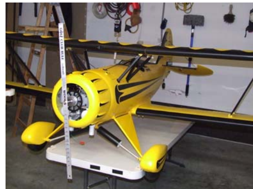
WACO with a Zero Pitch Prop