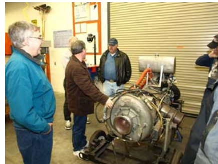
Jet engine, maintenance training